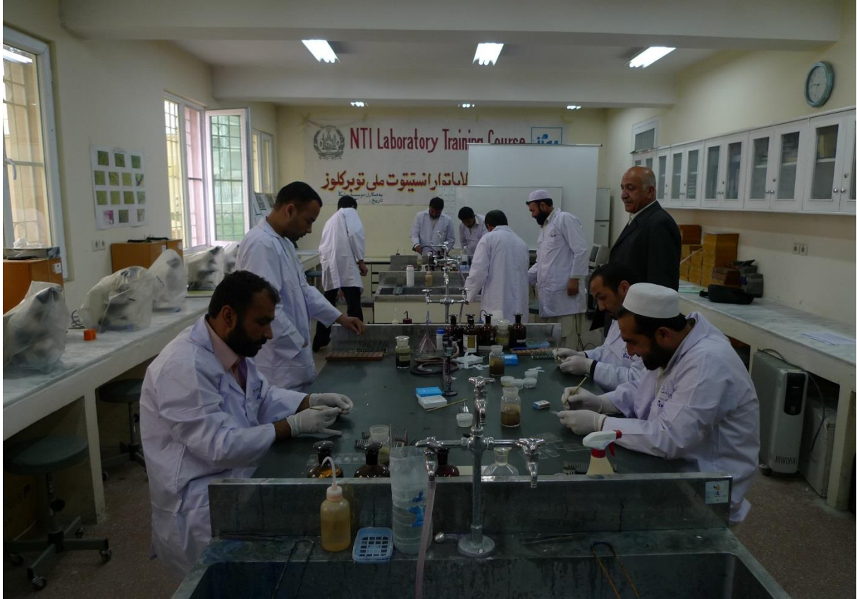
Training for laboratory technicians in National Tuberculosis Institute