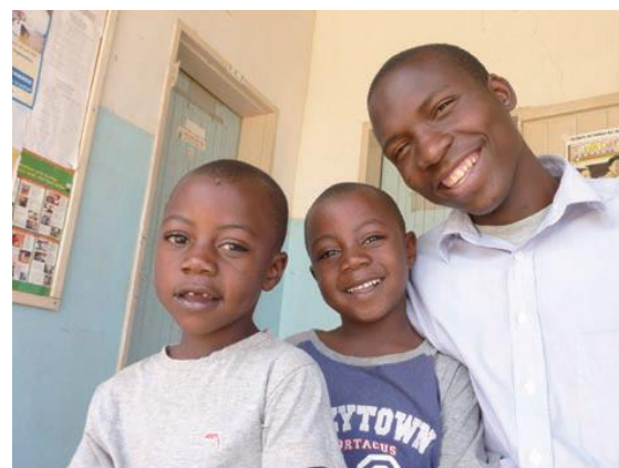
A family waiting for the ART service in the nearby health center