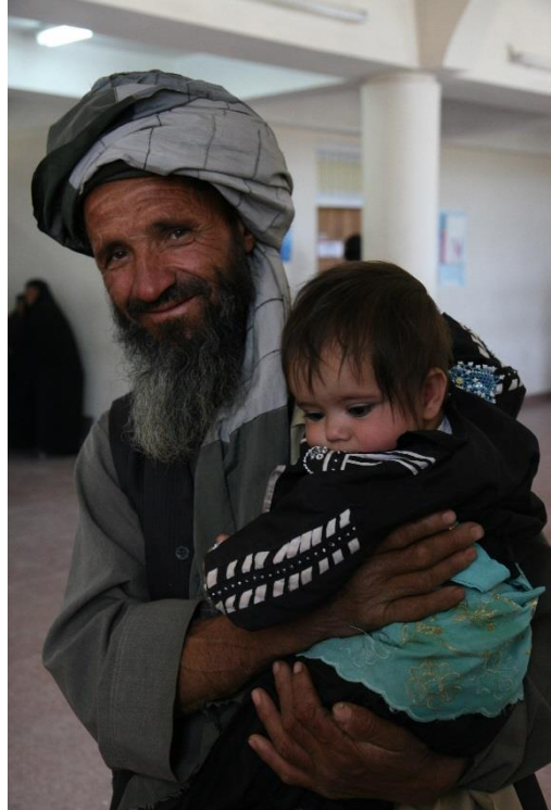
Patients visiting the Infectious Disease Hospital