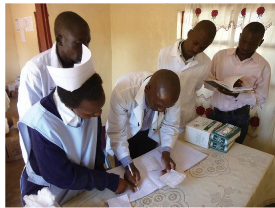
The staff of the district hospital and health center checking the client information