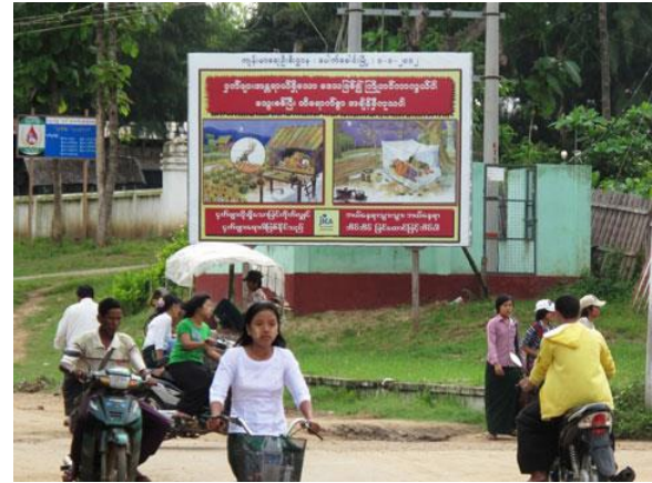
Awareness raising for Malaria