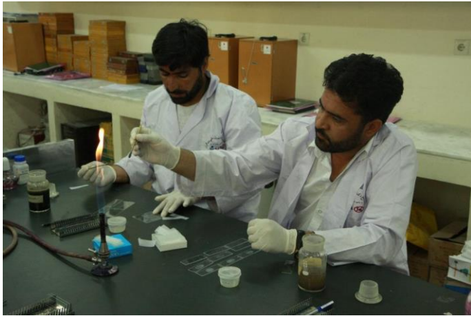
Conducting smear testing