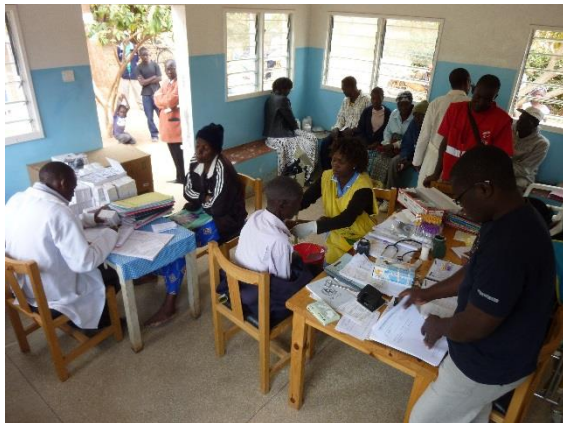
The mobile ART team of the district hospital providing the HIV/AIDS services in the rural health center

An increase in the number of the ART clients in the 4 districts supported by the project (The project supported 4 districts out of 15 pilot districts under the National ART Program)