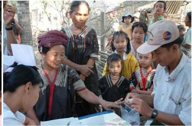
Malaria treatment by volunteers and health center staff in the community