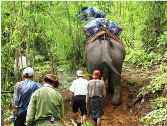
Transporting the mosquito nets to the remote area