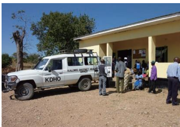
The mobile ART team visiting the rural health center